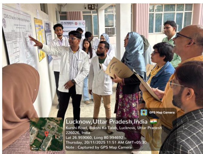
Evaluation and Discussion of Posters by Expert and Faculty Members during National Pharmacy Week